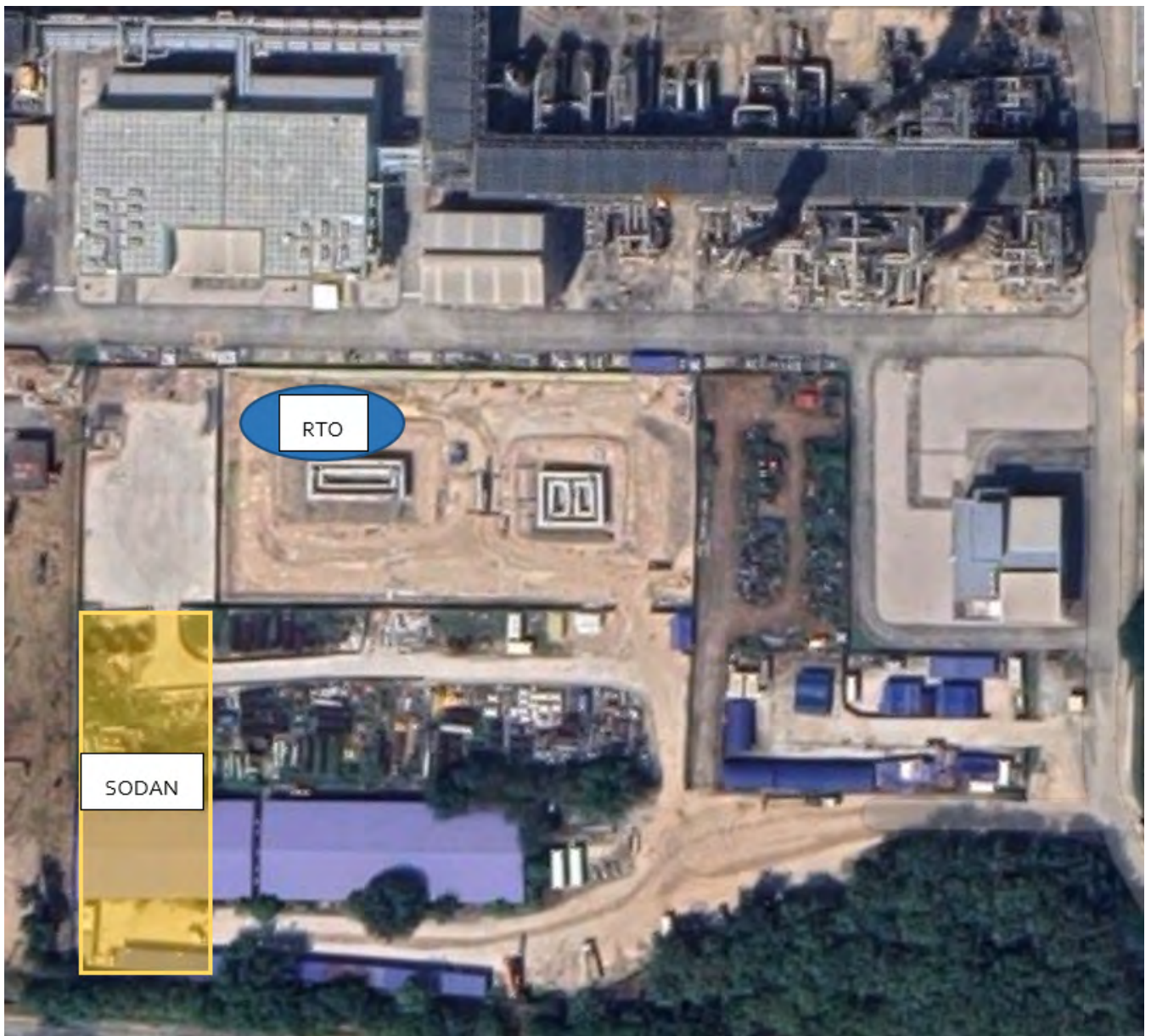
Figure 2 Show tie-in location of CO2

Quality Safety Health Environment Lab Energy