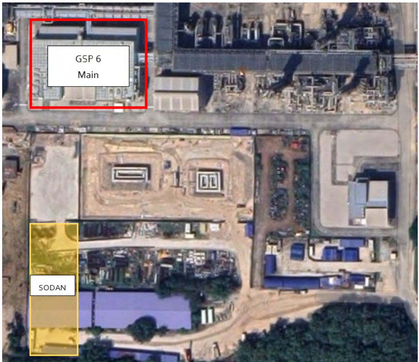
Figure 4 Show tie-in location of Electrical power